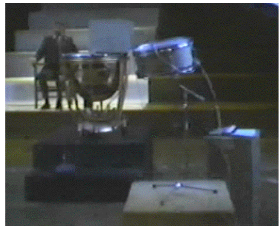
Figure 2. Screenshots from a performance of Alvin Lucier's, Music for Solo Performer , 1965. On the left, Lucier places himself into a meditative state to induce alpha waves whose electrical signals he then amplifies. The shot on the right shows in the foreground, a small section of the percussion devices Lucier placed speakers on (kettle drum, snare drum and cardboard box in this picture). When Lucier reached an alpha state, the electrical signals of his amplified alpha waves were distributed via the speakers, which would in turn rattle the resonant instruments. Lucier is in the background.