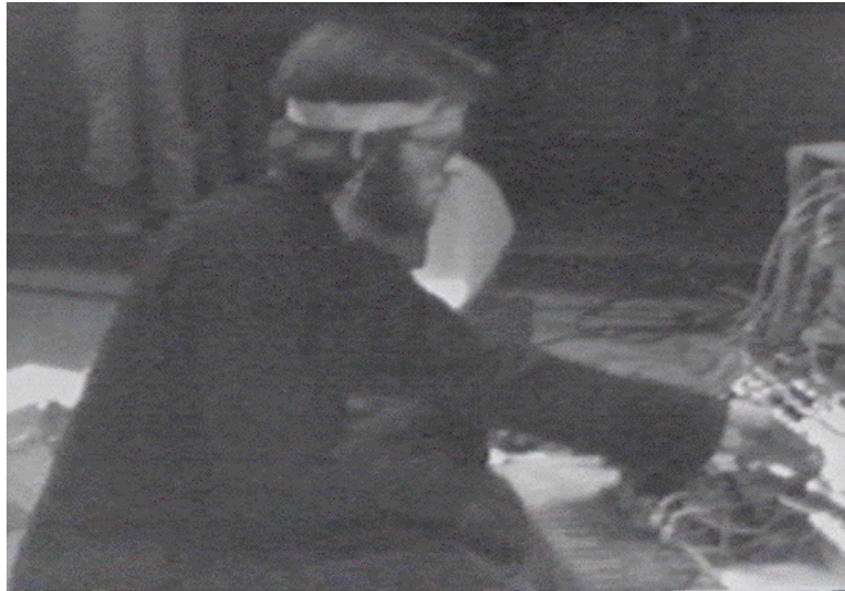
Figure 3. David Rosenboom performing On Becoming Invisible in 1977. In this section of the piece Rosenboom plays a touch-sensitive keyboard effectively improvising with his brain waves captured in real-time.

topography with which Rosenboom improvises.