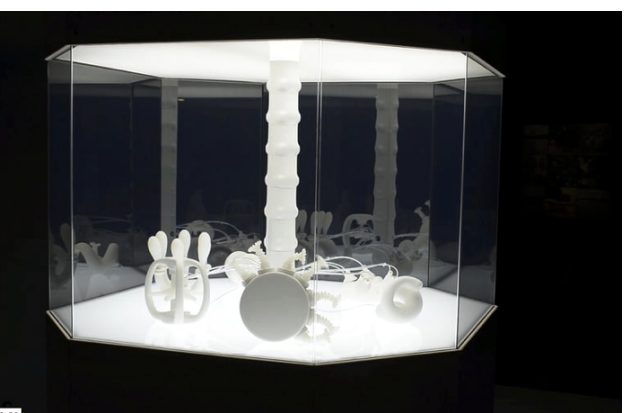
Figure 2. Jonathan Pêpe, Exo-biote (2015), Le Fresnoy, National Studio of Contemporary Arts; Neuflize OBC; INRIA, the DEFROST team. © Jonathan Pêpe

A small number of artworks currently exist that make use of technological means that can be considered variations of soft robotic technology. I Jonathan Pêpe's installation Exobiote (2015) is a notable example. It was produced in collaboration with soft robotics researchers at Université de Lille. The work consists of a transparent display case that contains several small white rubber parts in geometric and organic shapes, all kept in a very clean and designed commodity aesthetic.