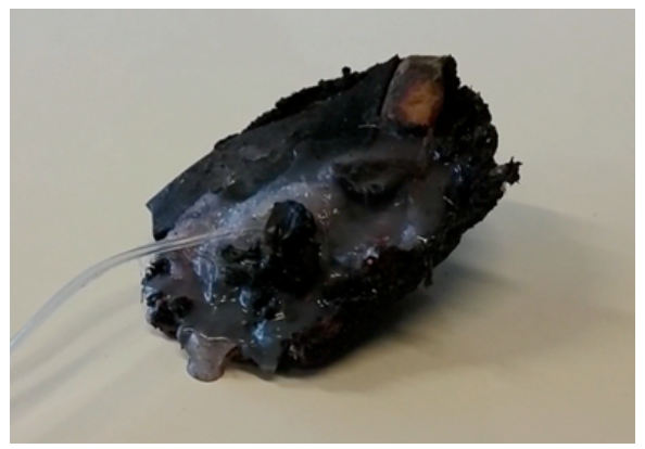
Figure 5. Entropy (2016). Video: https://www.youtube.com/watch?v=y3MTcC0x5-g. © Jonas Jørgensen

The prototype was one in a series of material experiments in combining highly elastic silicone with other materials.