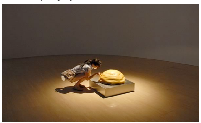
Figure 4. Paula Gaetano Adi, Alexitima (2006/2007), Autonomous Robotic Agent. © Paula Gaetano Adi

Paula Gaetano Adi's biomorphic half-spherical autonomous robotic agent Alexitimia (2006-2007) is another early example of a soft robotic artwork. Interestingly it was produced before soft robotics had become a prolific research field and it was designed and constructed by the artist herself. Like BRALL it interacts with audience members through touch. Here, however, yet another sensorial register is added: The tactile experience of soft latex rubber bending upon impact is accompanied by sensations of wetness as the sculpture responds to haptic stimulation with the secretion of a sweat-like fluid. Gaetana Adi posits the work as an exploration of "artificial corporeality" (as a supplement or alternative to artificial intelligence) and robotic body language (Gaetano Adi, 2007)