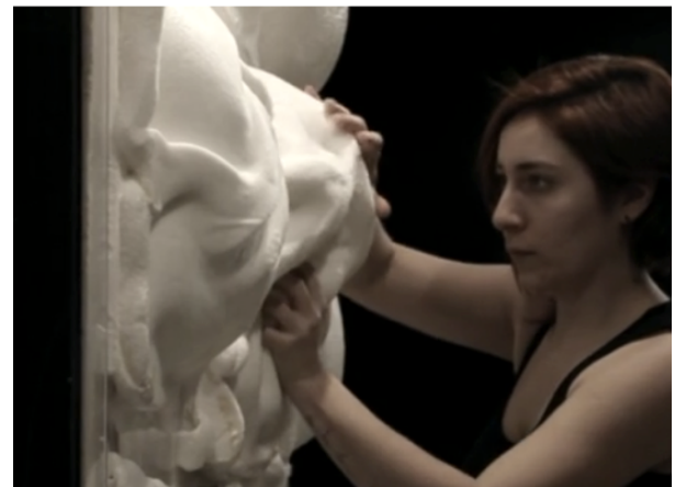
Figure 3. Ece Polen Budak and Ozge Akbulut, BRALL (2015) (detail), silicone on polycarbonate panel, 145 × 145cm. © Ece Polen Budak and Ozge Akbulut

Another example that is also the result of interdisciplinary collaboration between soft roboticists and an artist is THE BREATHING WALL (BRALL) (2015).