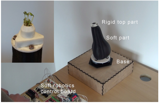
Figure 10. Phytomatonic 01 (2016). The robotic part of the system and the rigid tip of the robot with the three LDRs and cress plants.

The central element in the prototype Phytomatonic 01 is a black soft robotic tentacle. This soft body is equipped with three light-dependent resistors (LDRs) at its tip that allow the robot to detect incoming light. Directly below each LDR are three separate air chambers that can be inflated with an electrical pump to actuate the robot and make it move. At the tip of the robot, ordinary cress plants are placed. The robotic part of Phytomatonic 01 replicates