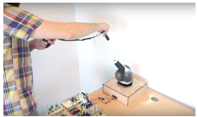
Figure 11. An overview of the prototype Phytomatonic 01 . Video: https://www.youtube.com/watch?v=-awxAXI035E © Jonas Jørgensen

characteristic aspects of a growing plant by means of soft robotics technology. More specifically: its phototropic behavior and the mechanism by which directional change is accomplished through cell elongation on the shady side of the stem (triggered by an accumulation of the plant hormone Auxin). The robotic part's mode of functioning thus echoes the working of the plants at its tip and the robot's light-seeking behavior evokes notions of a common desire for light shared by both the biological and technical part of the system. The technological part of the system succeeds in replicating a biological mechanism through the use of soft robotics technology but for a goal that from a practical viewpoint may seem entirely redundant: The robot is programmed to position the plants in the direction of the incoming light - something that the plants are perfectly able to accomplish on their own.