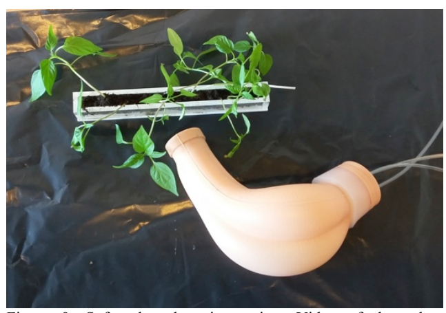
Figure 9. Soft robot-plant interaction. Video of the robot: https://www.youtube.com/watch?v=BO9zXX_XHr4

Phytomatonic is a series of prototypes that explore how soft silicone might afford an artificial agent other relations with biotic elements in an environment than rigid materials. The series also relates to questions on how we can speak and think about biological organisms and robots coming together in ways that go beyond instrumentality and anthropocentrism.