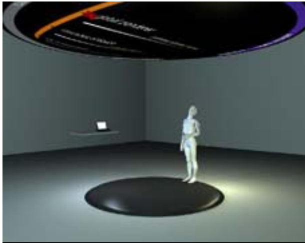
Fig. 3 Daniela Plewe: Ultima Ratio , 1997.

But without exception, neither these artworks, nor the last decades of digital art in general have received the appropriate attention by the academic disciplines or have been added in adequate numbers to the collections of museums and galleries. We are thus in danger of erasing a significant portion of the cultural memory of our recent history.