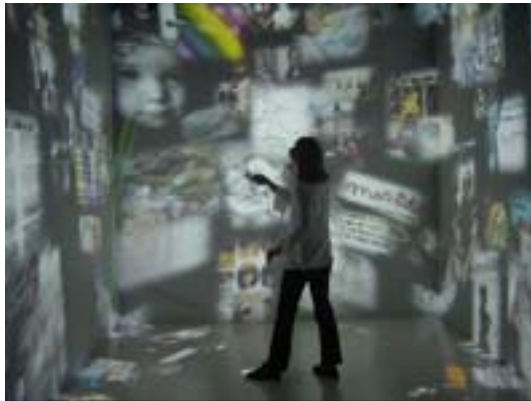
Fig. 5 Christa Sommerer / Laurent Mignonneau: The Living Web , 2002.

competence, which goes beyond mere technical skills, is difficult to acquire if the area of historic media experience is excluded. Media exert a general influence on forms of perceiving space, objects, and time and they are tied inextricably to humankind's evolution of sense faculties. For how people see and what they see are not simple physiological questions; they are complex cultural processes, which are influenced by many and various social and media-technological innovations. These processes have developed specific characteristics within different cultures and it is possible to decipher these step by step in the legacy left by historical media and literature concerned with visualization, including from the fields of medicine and optics. Not least, in this way light can be shed on the genesis of new media, which are frequently encountered for the first time in works of art as utopian or visionary models.