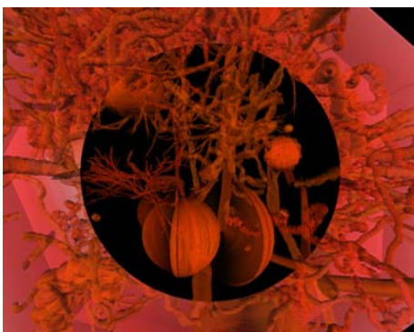
Fig. 4 Christa Sommerer & Laurent Mignonneau : Anthroposcope 1993.

For the interests of media art it is of importance that we continue to take media art history into the mainstream of art history and that we cultivate a proximity to film- cultural and media studies, computer science, but also philosophy and other sciences dealing with images.